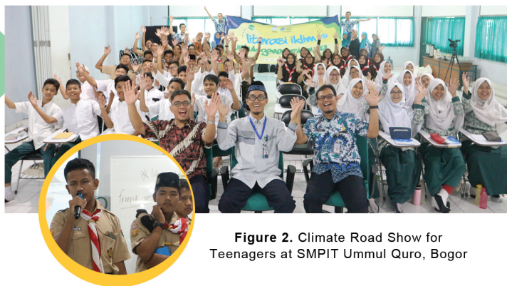
Figure 2. Climate Road Show for Teenagers at SMPIT Ummul Quro, Bogor

Climate Road Show for Teenagers was held on October 25th, 2019 at SMPIT Ummul Quro, an junior high school in Bogor. It was attended by 50 students,