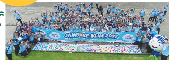
Figure 3. The Children Declaration on Climate Change and Disaster Resilience

The success story of Climate Road Show for Elementary brings that program into bigger event in 2019. Almost all participants from the previous road show events were invited to attend Climate Jamboree 2019 . It was held on April 30th, 2019 at National Monument open area and BMKG head office, Jakarta. Attended by 214 students and 33 teachers from 32 elementary schools, the participants were educated with more knowledge on climate, completed with study visit to BMKG head office and Early Warning System Facilities. It was also best moment to declare children's commitments in keeping their environment clean and safe. It was presented as The Children Declaration on Climate and Disaster Resilience.