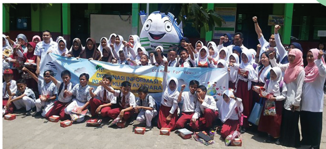
Figure 1. Climate Road Show for Elementary at SDN Rangkapan Jaya, Depok